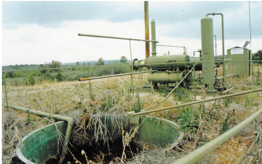
Photo 3-15 Typical Conventional Well Facilities - Immediate Foreground View (0-300 feet)