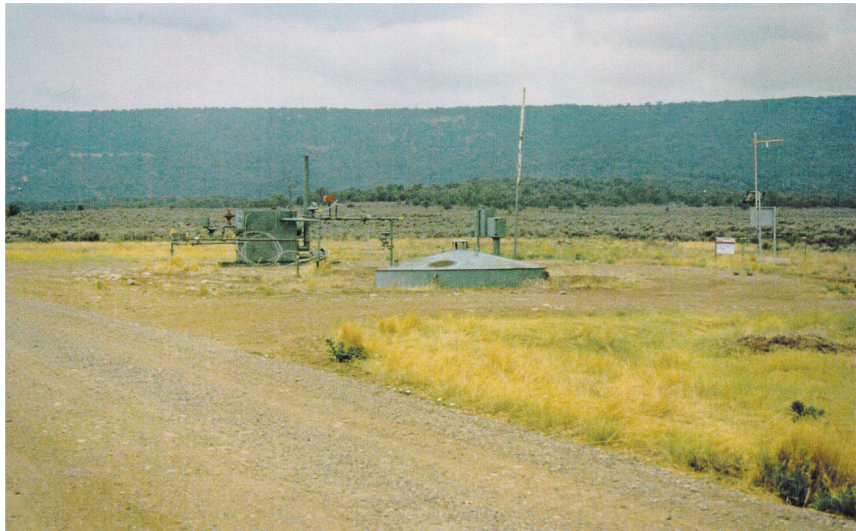
Photo 3-8 Covered Produced Water Pit (only associated with conventional wells)