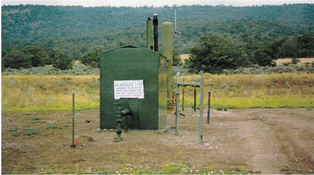
Photo 3-3 Typical Meter House