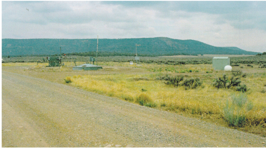
Photo 3-14 Typical Conventional Well Facilities - Foreground View (300 feet - .25 mile)