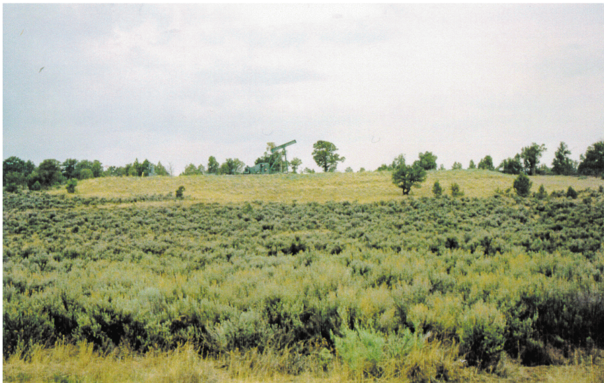
Photo 3-13 Typical CBM Well Facilities - Foreground View (300 feet-.25 mile)