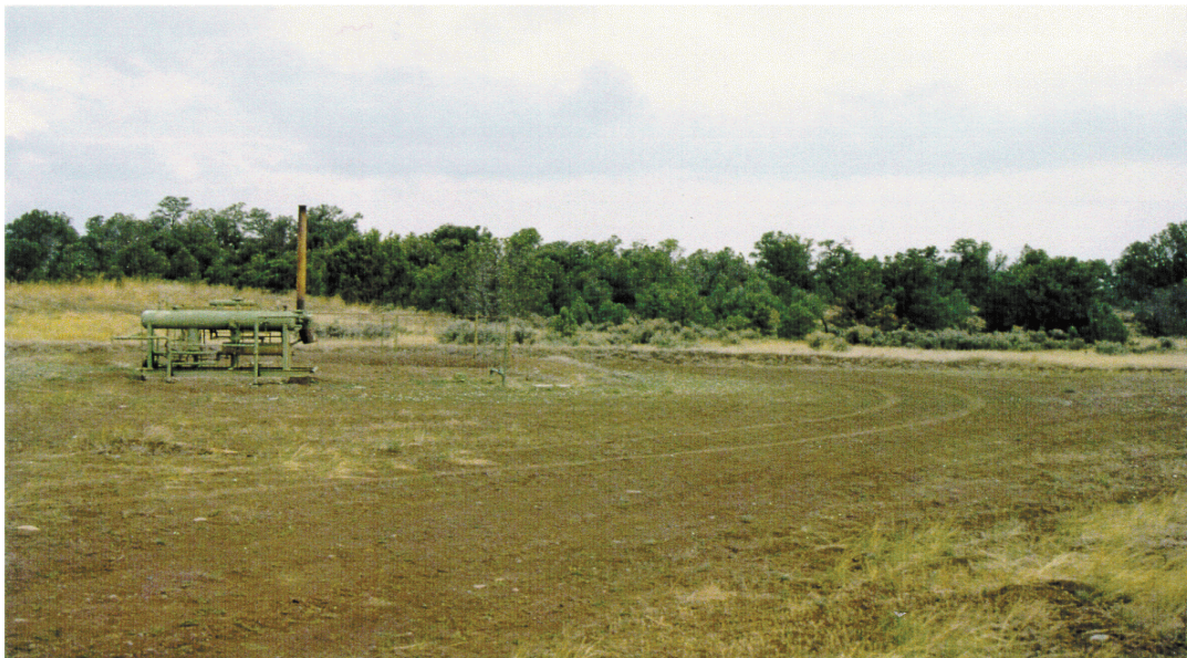
Photo 3-2 Typical Separator