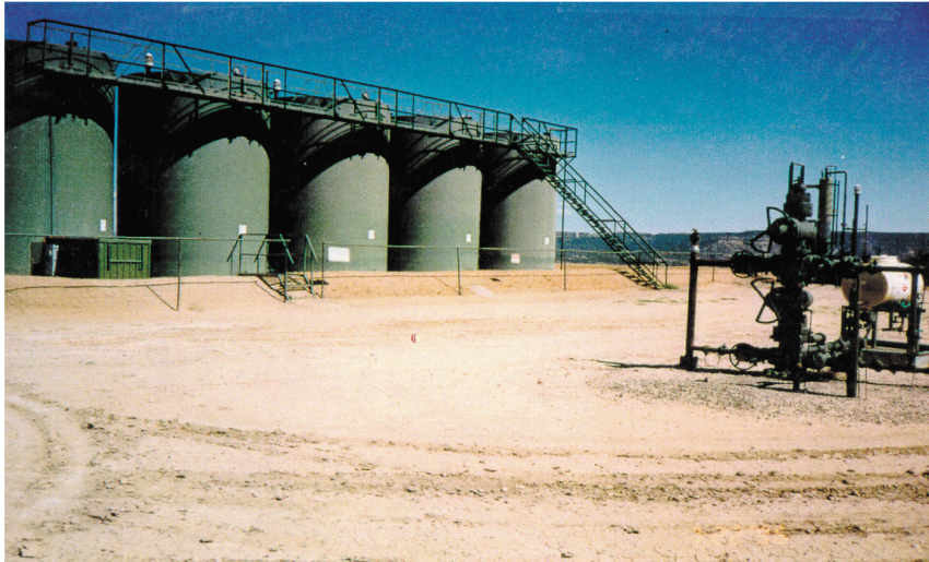
Photo 3-9 On-site Water Storage Tank