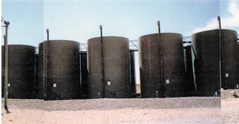
Photo 3-11 Water Injection Facilities (only associated with CBM wells; currently there are 30 of these facilities on the Reservation)