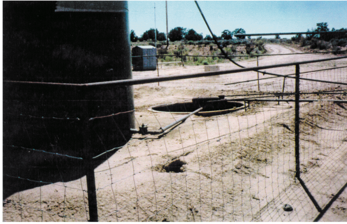
Photo 3-7 Typical Condensate Tank and Produced Water Pit (only associated with conventional wells)