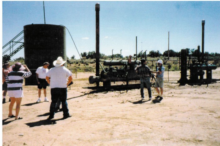
Photo 3-6 Typical Condensate Tank (only associated with conventional wells)