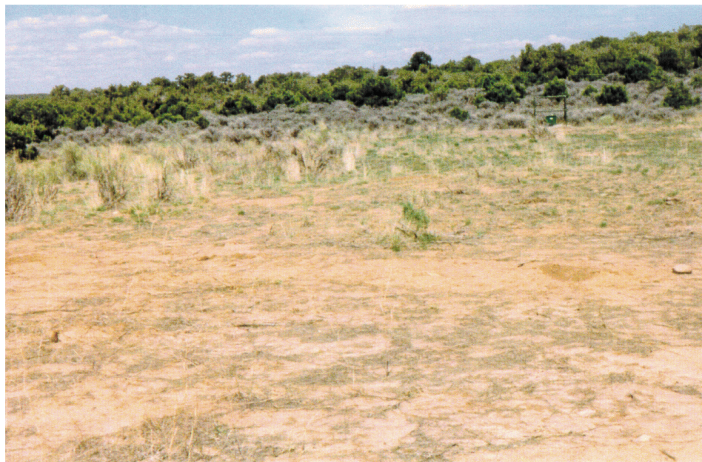
Photo 3-10 Cathodic Protection Well