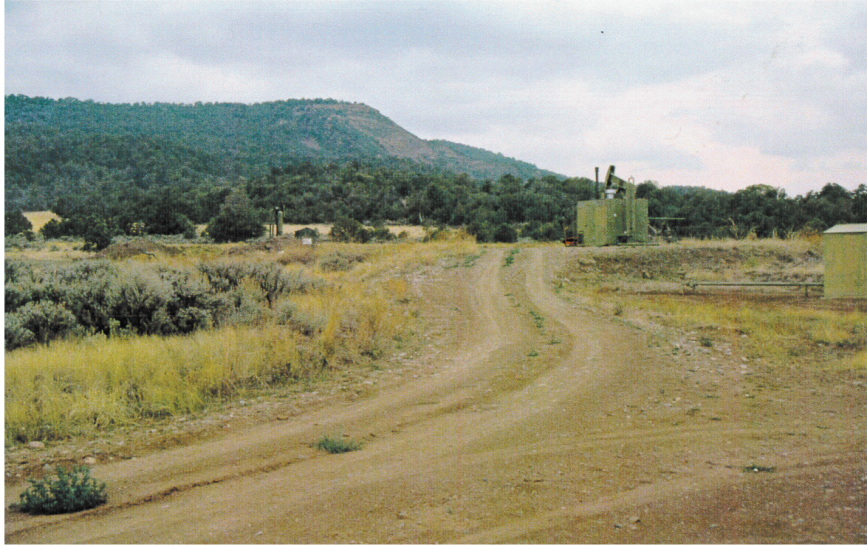
Photo 3-5 Typical Dehydrator (typically associated with conventional wells)