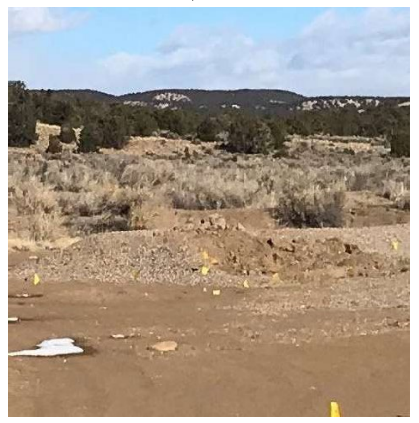
WTS tank battery and tie-in removed.

Valve Can at N end of line near tie-in with the trunk line has been removed.